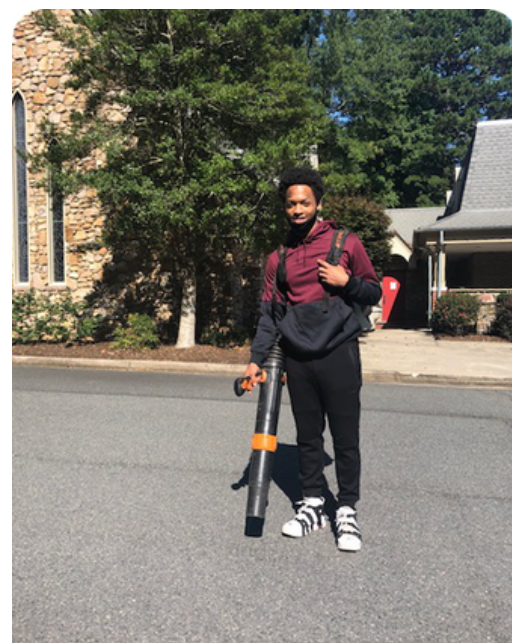
Adolescent Residential Apprentice at work